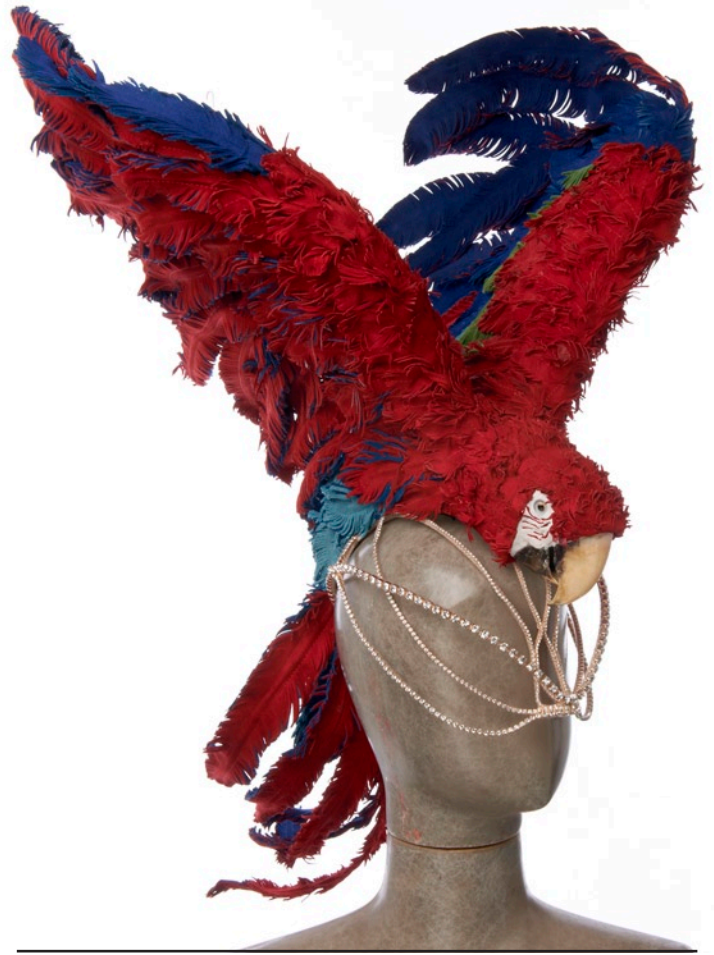
Red Macaw Parrot Headdress

Dramatic, ceremonial couture works of art, showcasing the skills of Artisan, Craftsman and Sculptor within Millinery. Each and every feather has been hand-cut from twin layers of fine suede in vibrant Macaw colours, while Venetian-style masks sparkle beneath in Swarovski Crystal Chain.