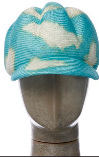
Cloud Bubble Cap