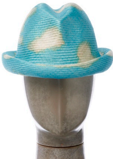
Rolled Cloud Trilby