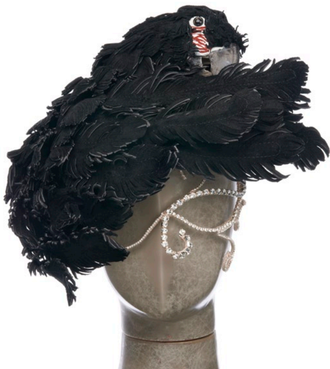
Black Parrot Headdress