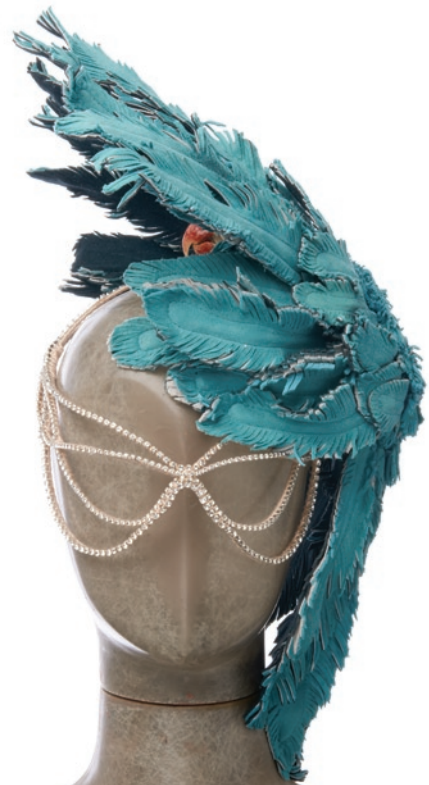
Blue Indian Ringneck Parrot Headdress