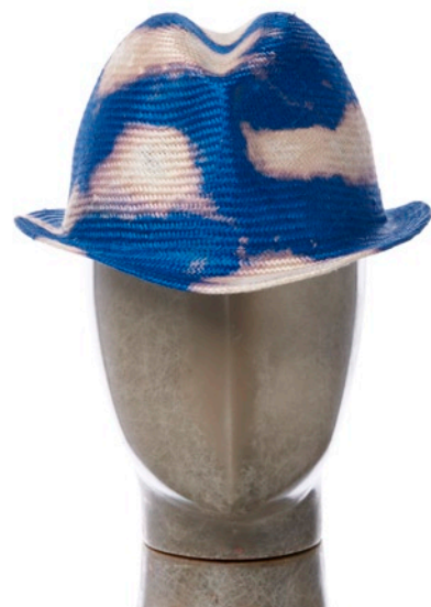
Pinched Cloud Trilby